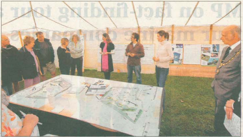
■ Local councillors and committee members discuss changes for the pitch and surrounding area.