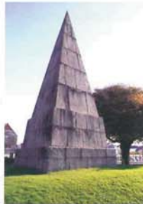
Top Quotes from servicemen who were involved in the St Nazaire raid in 1942 Above The 10m-high Killigrew Monument near Events Square in Falmouth

obelisks or a man on a horse or a pedestal. These days, most public artworks have come off the pedestal and are quite often expected to work harder down amongst the crowds.